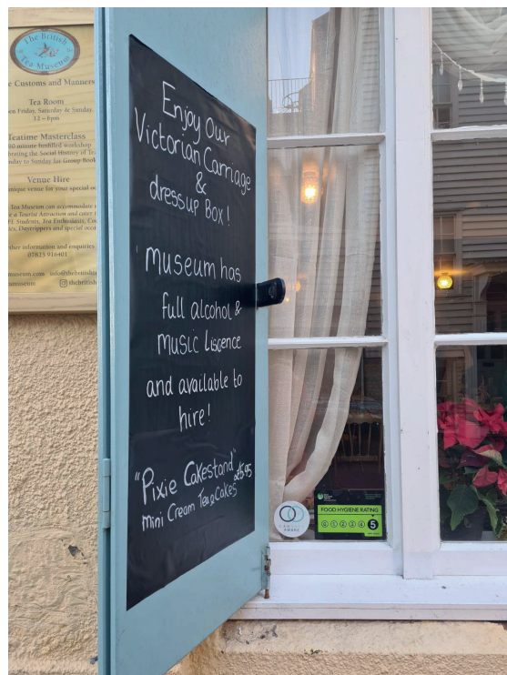
Cancard aware sticker example

At Cancard, we run a free training session to enable your company to become Cancard Certified. We consider businesses and organisations who complete this course to be part of the Cancard family. Organisations who go on to become certified will have their company listed on the Cancard website as a 'safe space' for patients, and with over 40,000 members and 1000 visitors a day, it pays to become certified!